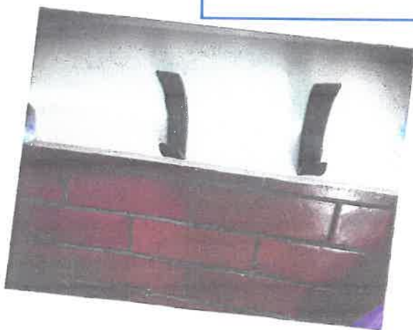
My coat and bag will go on my peg.