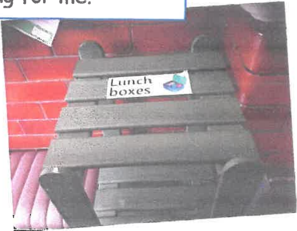
My lunch box will go on the shelf.