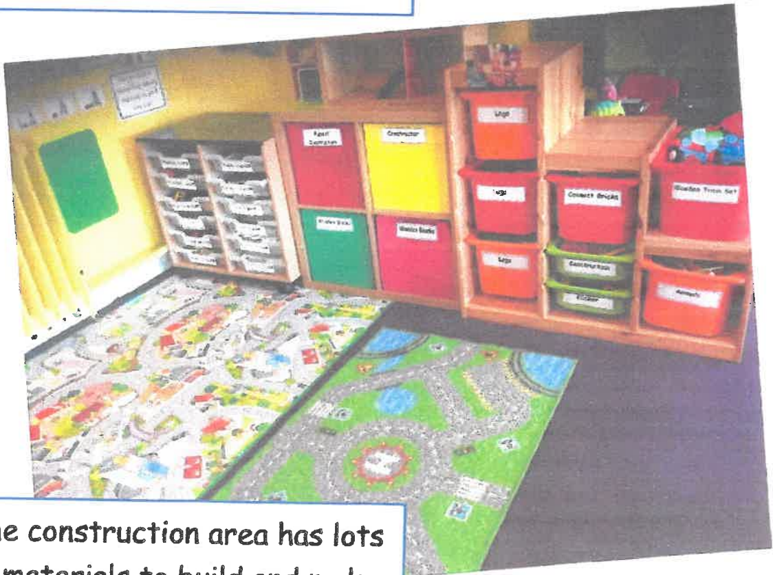
The construction area has lots of materials to build and make.