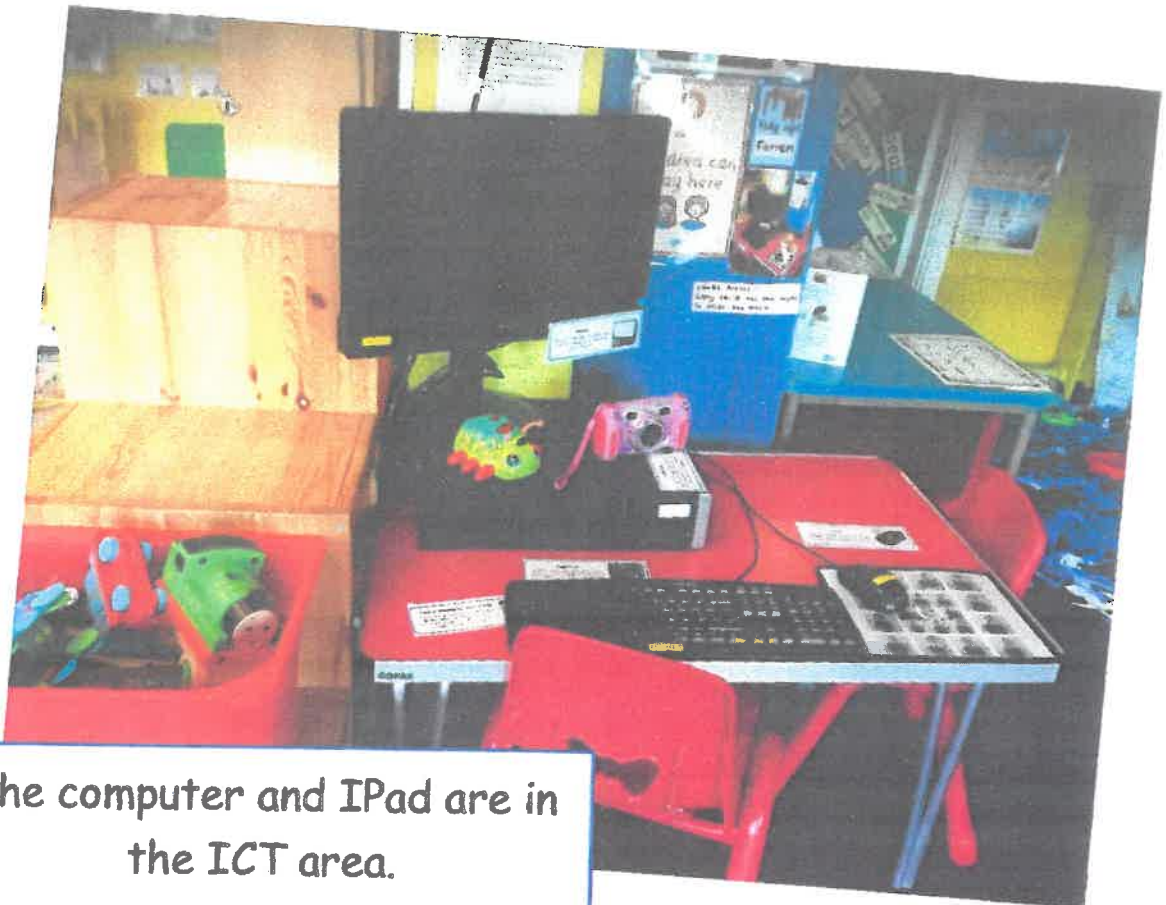
The computer and iPad are in the ICT area.