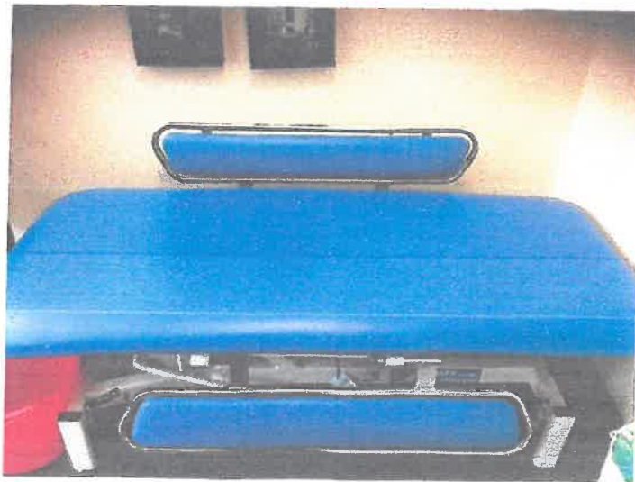
We will get our pull-up changed on the changing bed.