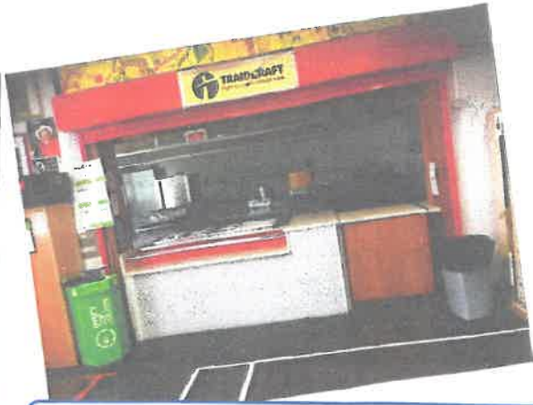
Lunch is served from the kitchen.