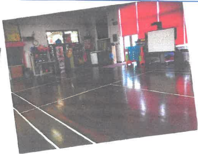
We have lunch, assembly and P.E. in the school hall.