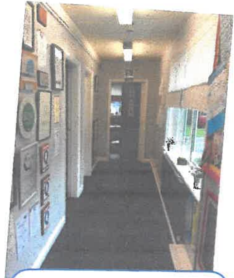
The corridor to the office and the changing room.