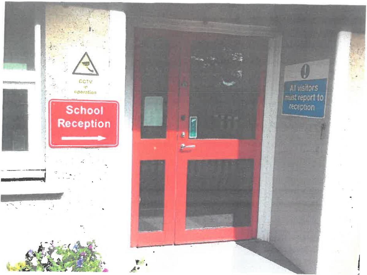
This is the door we will come in to School. My Teachers will be waiting for me.