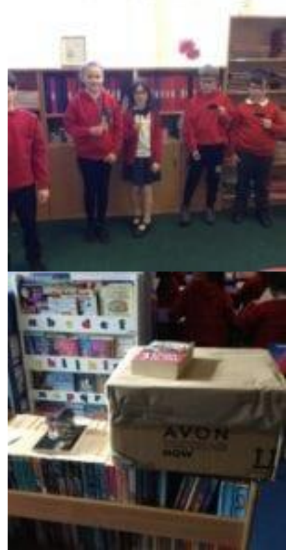
Wear a Hat Day

Children took part in Wear a Hat Day on Thursday 25<sup>th</sup> March in aid of Brain Tumour Research.