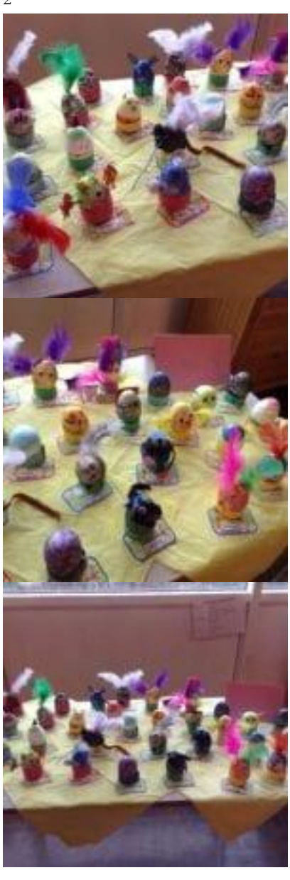
Class 4 winners were: