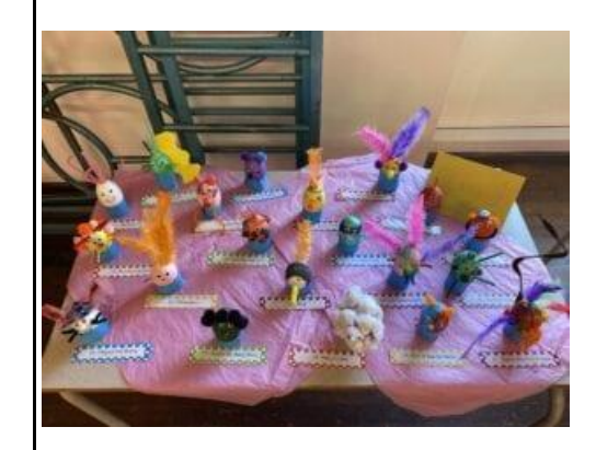
Class 2 winners were: