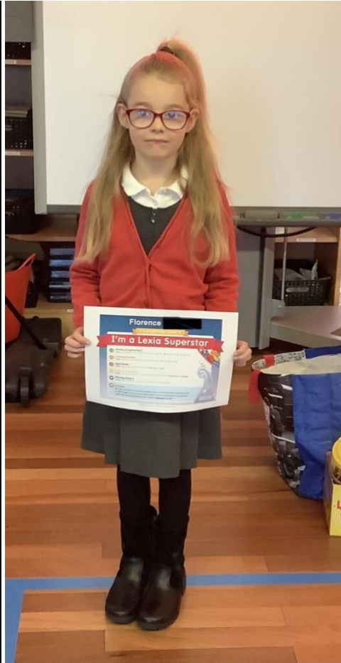
Halloween Disco - UNCRC Article 31 (leisure, play & culture)

Well done to everyone who has been accessing their Lexia and remember to try to use your APP whilst you are at home so that you can earn your certificates.