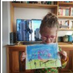
Class 4 memorable experience – The year is 1066!