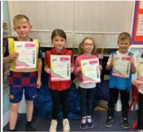
UNCRC Article 22-Governments must help in trying to reunite children refugees with their parents

Well done to this week's sports men and women .... Well deserved Sainsbury value certificates. Little super stars ★