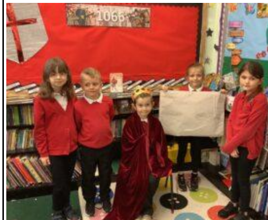
Inter House Competition

Backed by a council of advisors (The Witan), each challenger and Harold presented their claim to the throne!