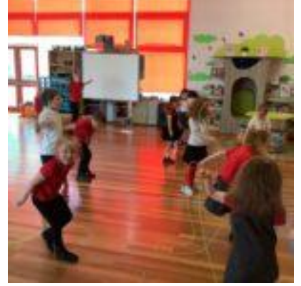
In Class 3 we had a fantastic time learning how to skip. We learned lots of new skills and had lots of fun.