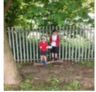
Class 2's Jubilee Celebrations

In Class 2 we have joined in lots of different activities to help learn and celebrate the Queens Platinum Jubilee. We have all made crowns and decorated flags in preparation for our whole school picnic tomorrow. We are excited to see you all there!