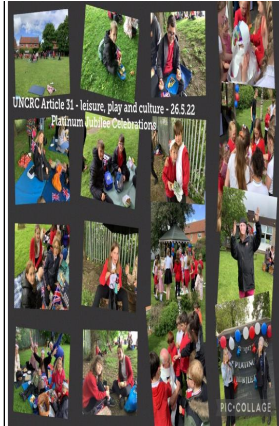
Class 1's Jubilee Celebrations

UNCRC Article 31: Every child has the right to rest and leisure, to engage in play and recreational activities and to participate freely in cultural life and the arts.