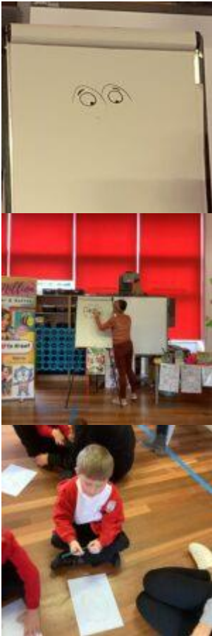
Class 4 – Raiders & Traders