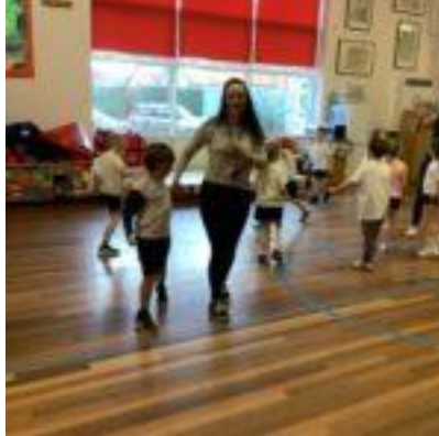
Judo Stars – 20.1.23