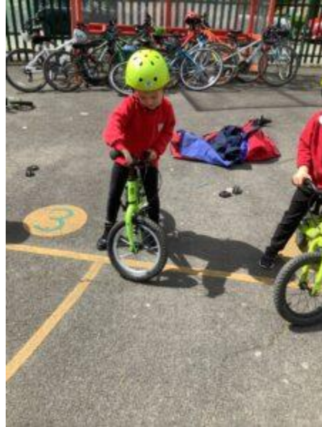
Bee Helpful – Chartwells / Bumblebee Conservation Trust – 26.5.23