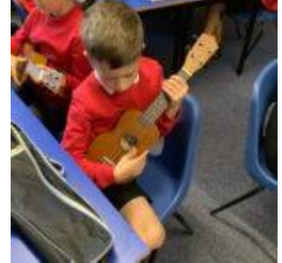
Native American Dreamcatchers in Class 4

In today's Art session, we used our previous plans for dreamcatchers to create some beautiful Native American inspired pieces. We've been