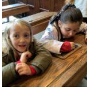
Class 3's first Ukulele lesson.