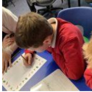
Harvest Festival – 24.10.23