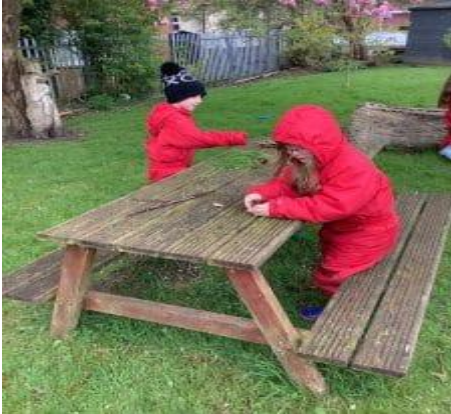
Pressed Flower Art in Class 2

In art we have learnt all about a famous artist, Georgia O Keffe. We learnt about how she used flowers as her initial inspiration for her drawings and paintings. We then used this inspiration to make our very own art work. We used pressed petals to make a picture using our initials. They look amazing!