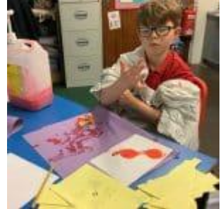
Clay Sculptures in Class 3

We made our very own clay sculptures of fruit and vegetables. We researched which ones we wanted to make before using clay and tools to shape them. We took our time adding detail and we will paint them next week to finish them off.