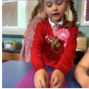
Anglo-Saxon prints in Class 4

In our Art session today, we created some Anglo-Saxon inspired prints, using red paint, paper and card! We had so much fun creating our unique designs and are going to add more detail with metallic pens.