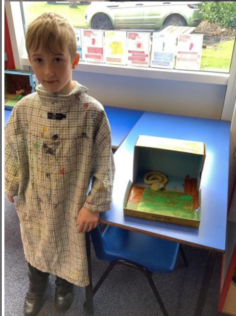
Art in Class 5

UNCRC Article 31 – leisure, play and artistic culture