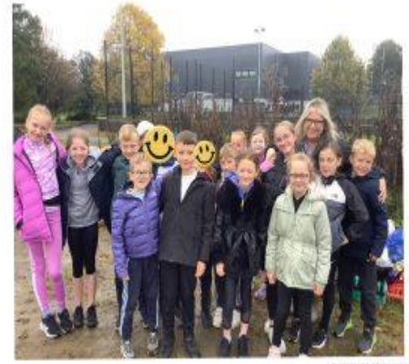
Stay 'n' Play Day in Class 1

A massive well done to our KS2 Cross Country team who braved the rain and mud to absolutely smash the cross country course! They all showed such determination and dedication to their running. They made us all proud! same again next year?