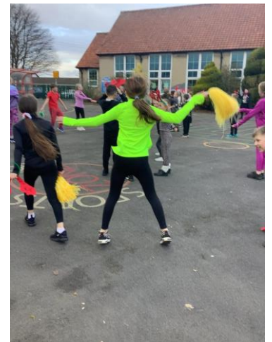
The Naughty Elves are back!