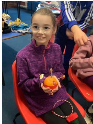
Reindeer Run – 16.12.24

UNCRC Article 31 – leisure, play and artistic culture