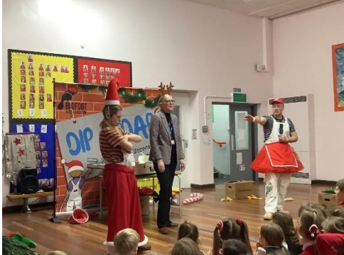
Forest School Critters

This week in Forest School, we used a mixture of natural resources and clay to create our very own critters! Check out our critters!