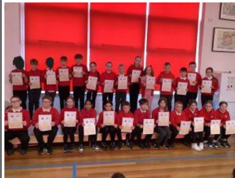
Ukulele and Violin concert

Rights Respecting Gold demonstrated by all our children.