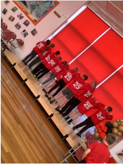
Year 6 Prom!