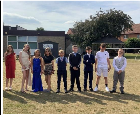
Nettleworth's Got Talent

Our year 6's had an amazing time at their prom. They all looked amazing and dressed up for the occasion! They danced the night away and showed off their singing skills on the karaoke! What a way to end their Primary School experience.