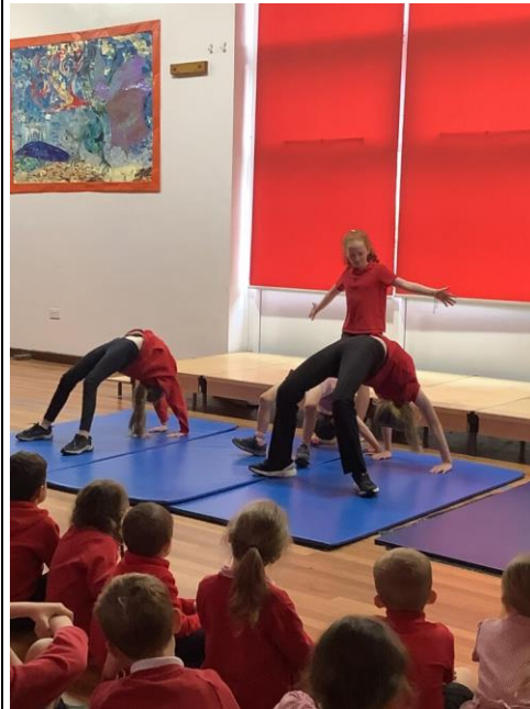
TT Rockstar Day

What an amazing afternoon we had, watching all of our talented children take part in our school talent show! The children and staff were all blown away with the performances the children put on and how confident they were! From singing and dancing, to telling jokes and performing magic... Nettleworth really has got talent!