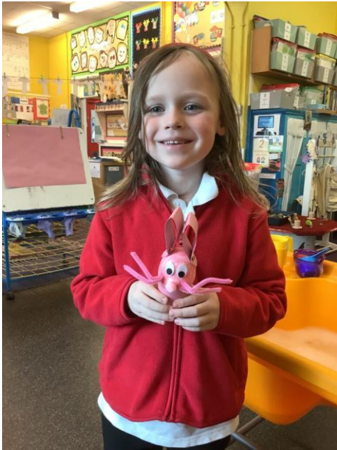
Forest School in Class 2